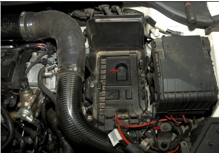
3. Unbolt battery tray – 3 10mm bolts, shown in picture.